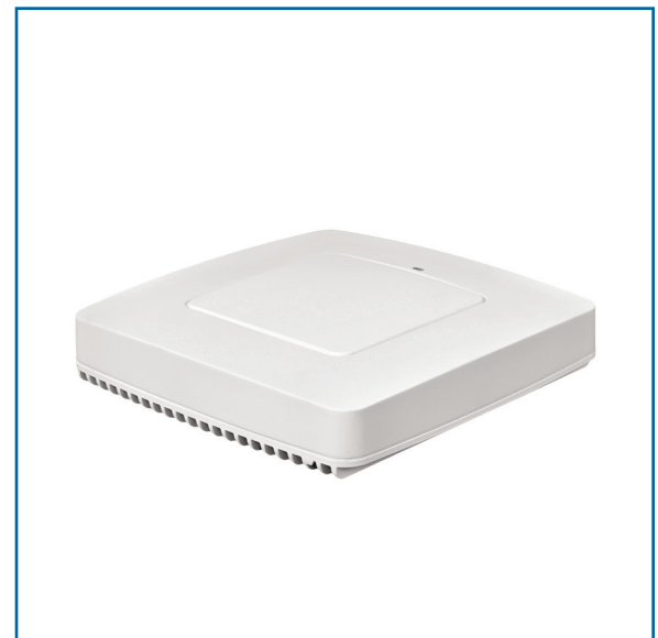
SCRN-330 | Figure 1

The SCRN-330 is an LTE-TDD small cell with self-organizing network (SON) capability. The SpiderCloud® enterprise radio access network (E-RAN) is part of the scalable small cell system. E-RAN hides the complexity of radio management and mobility and provides operators with a single touchpoint to aggregate and manage a large network of small cells.